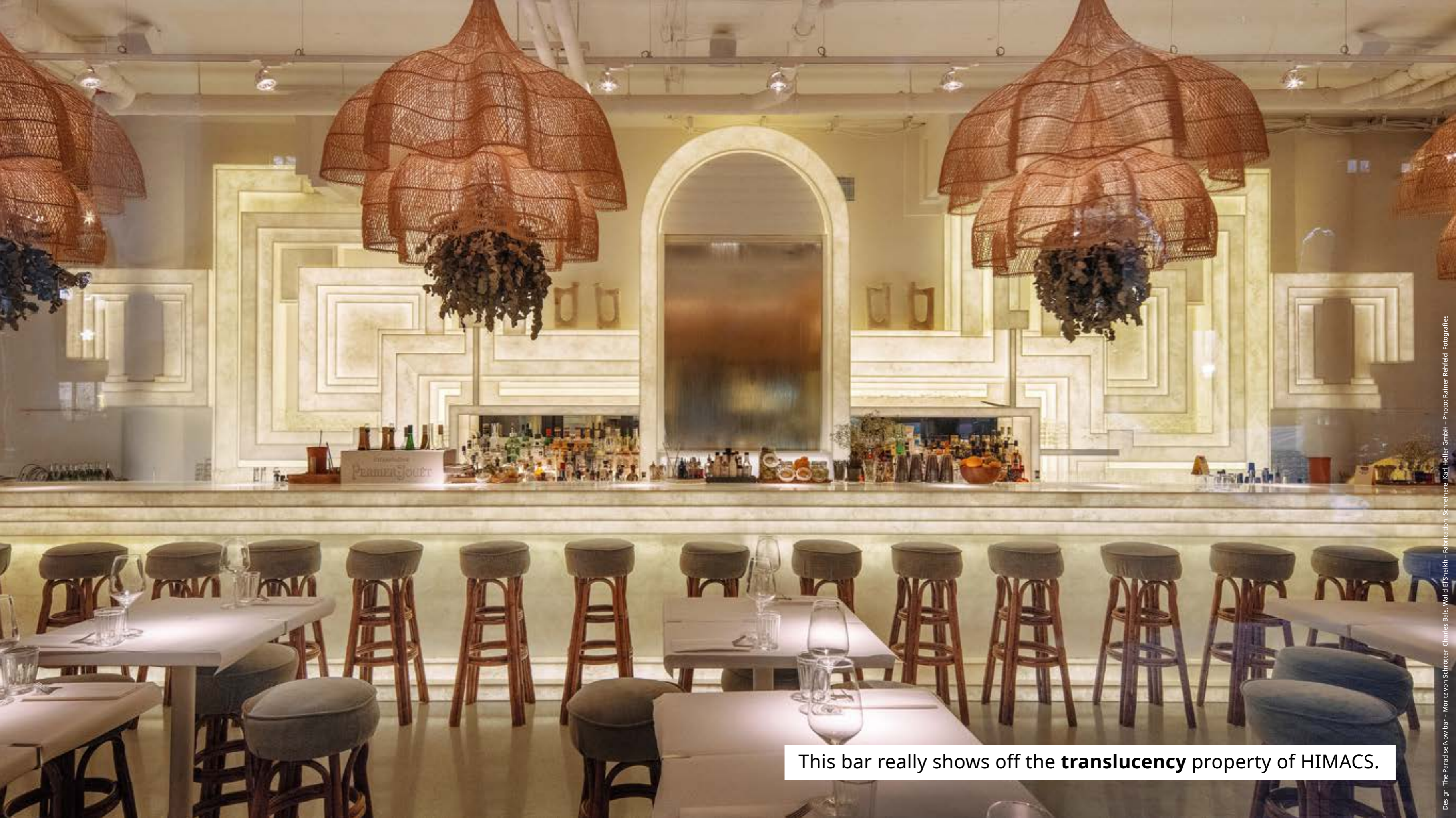
This bar really shows off the translucency property of HIMACS.