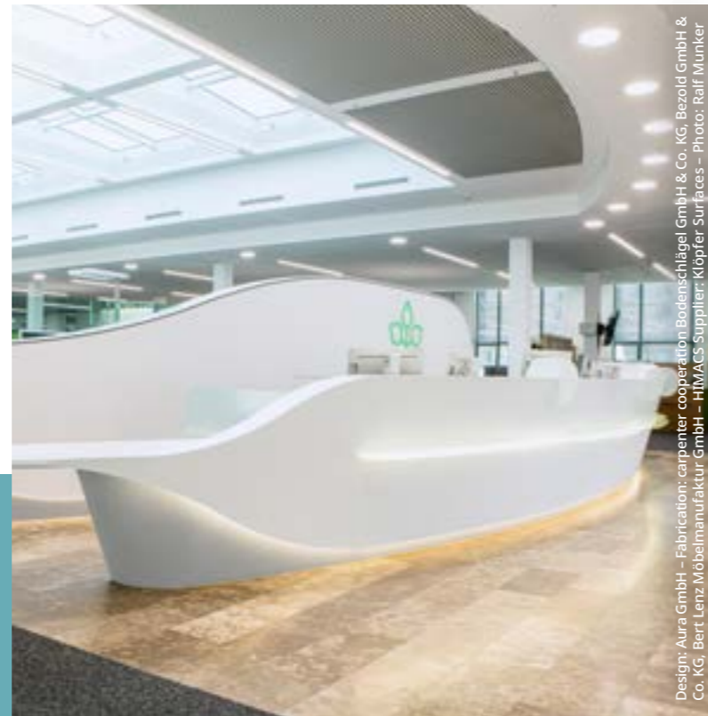
Design: Aura GmbH - Fabrication: carpenter cooperation Bodenschlägel GmbH & Co. KG, Bezold GmbH & Co. KG, Bert Lenz Möbelmanufaktur GmbH - HIMACS Supplier: Klopfer Surfaces - Photo: Ralf Munker