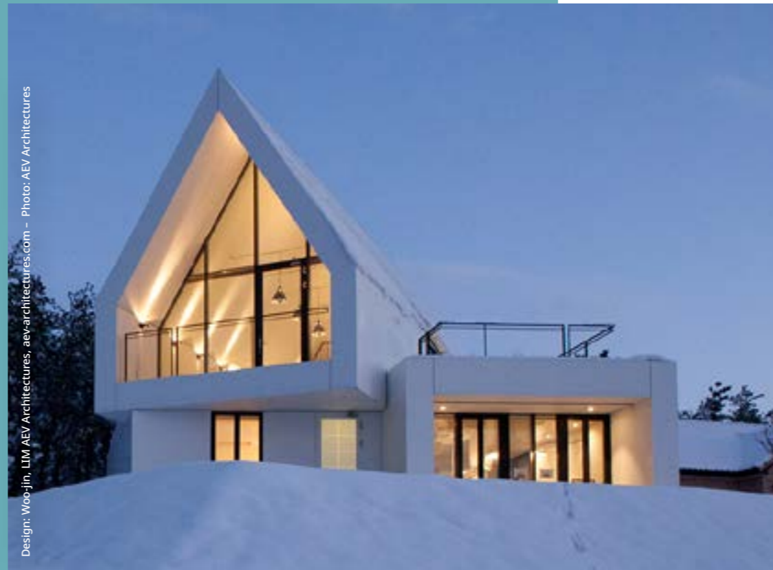
Design: Woojin LIM AEV Architectures, aev-architectures.com

The complete house facade made of HIMACS. Made to last for years, come rain or shine.