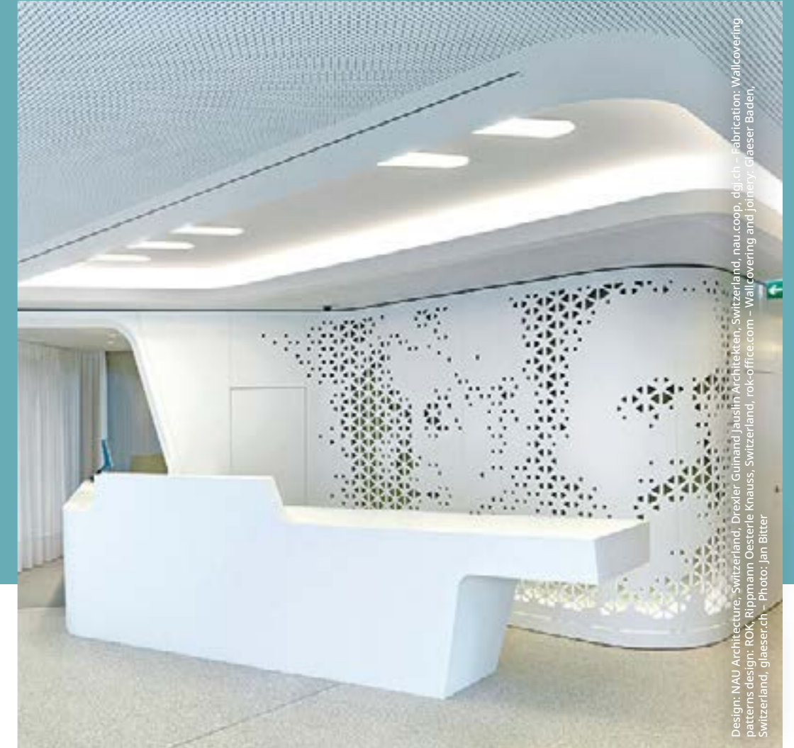
This counter in a bank in Zurich conveys respectability . And through the milled heads of the founders, also half of the company history. Perfect!

Design: Yousseux Architectes, France, yousseux.com - Fabrication: ASKA Interior, France, aska-interior.com