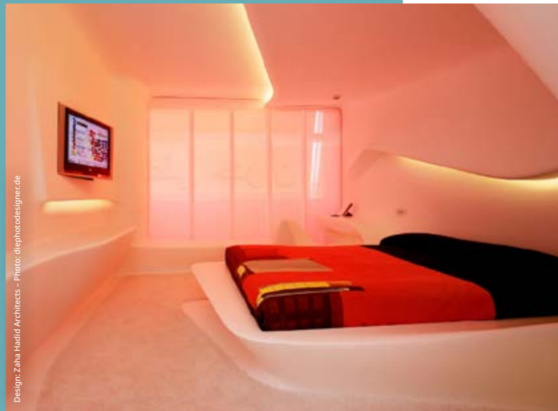
Design: Zaha Hadid Architects

A hotel room like a fantastic dream. Thermoforming, flush connected, light effects - isn't it exciting!