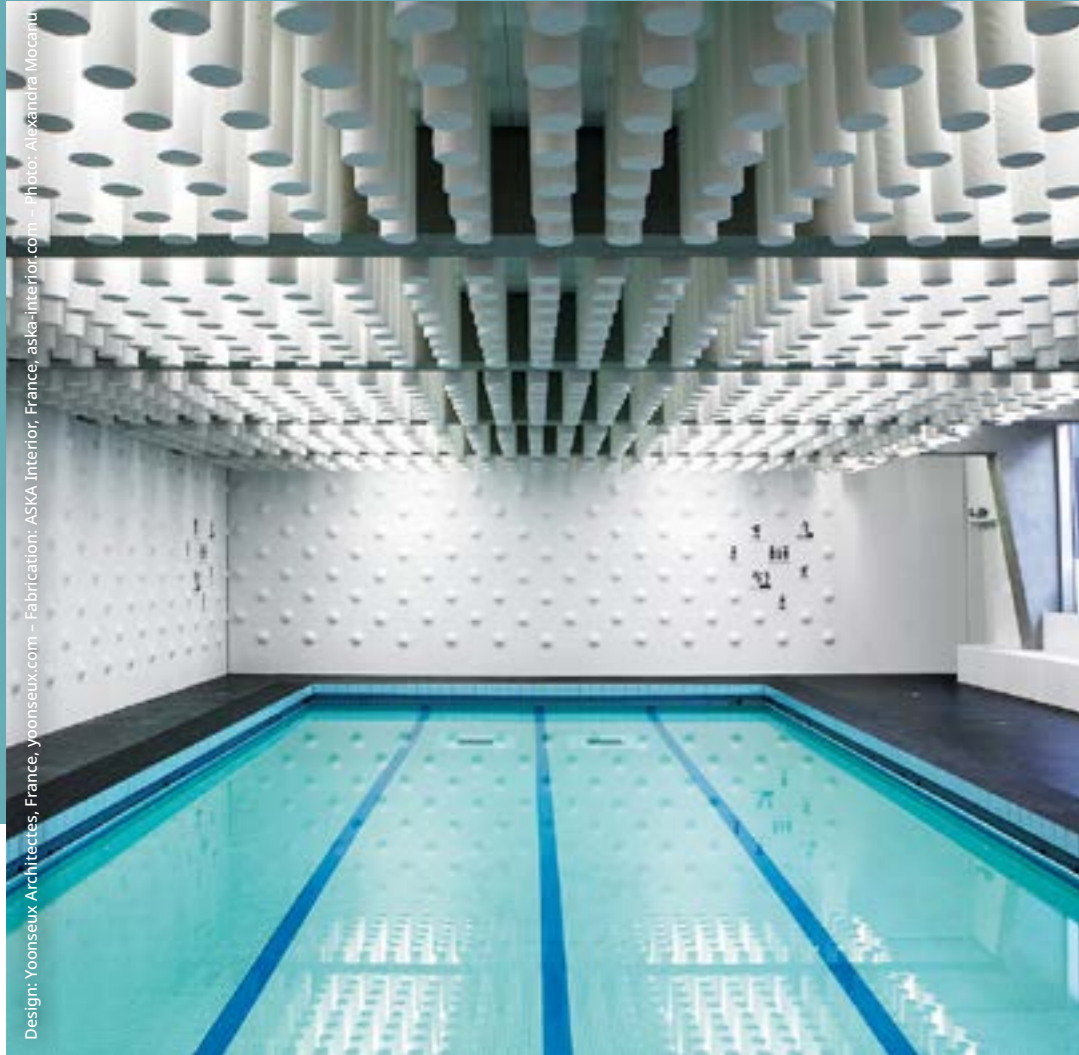
Thermoformed wall-claddings in one of Paris' coolest indoor pools.