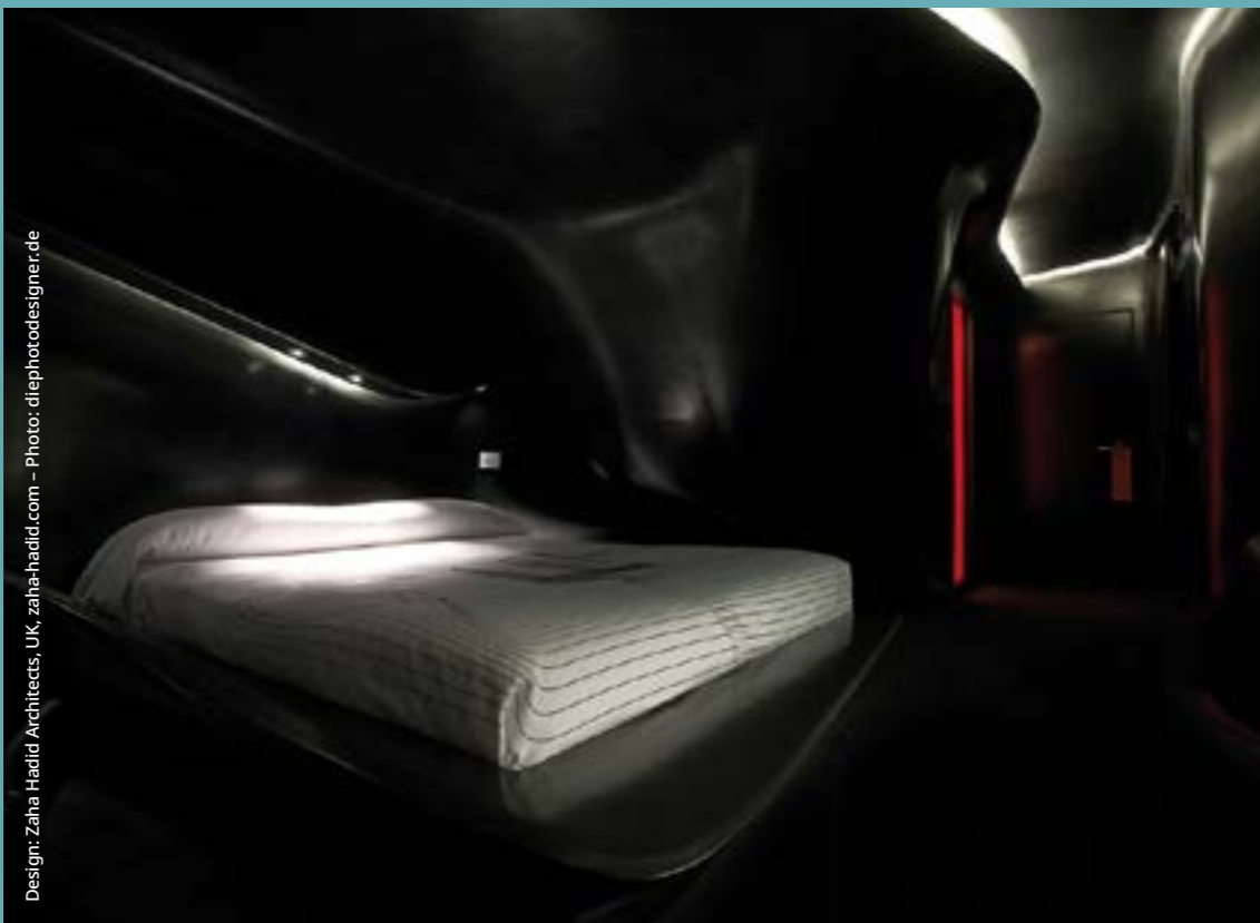
Design: Zaha Hadid Architects, UK; zaha-hadid.com

The complete house facade made of HIMACS. Made to last for years, come rain or shine.