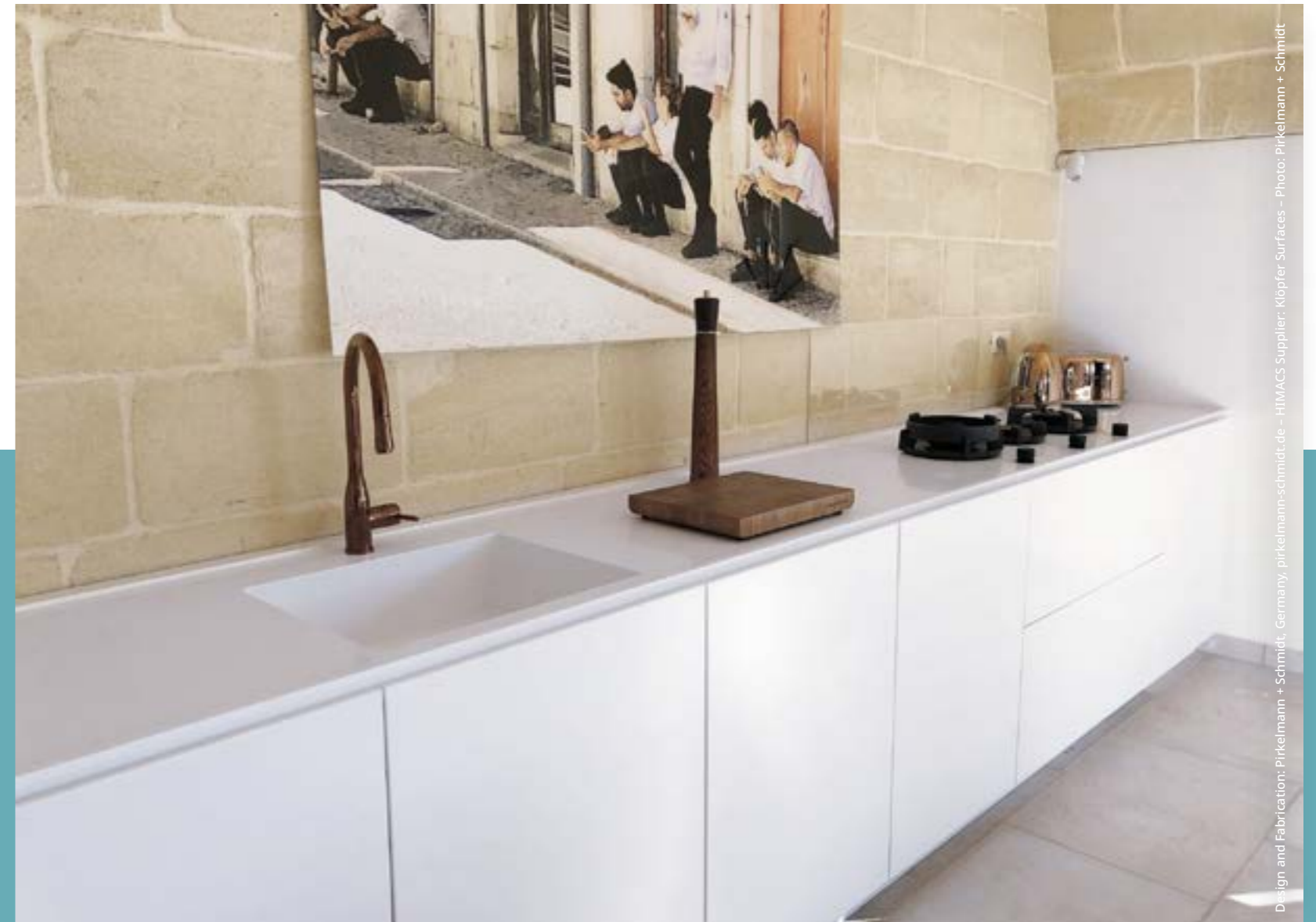
Natural colour and material mix. Straight lines.

Design and Fabrication: Pirkelmann + Schmidt, Germany, pirkelmann-schmidt.de - HIMACS Supplier: Klopfer Surfaces