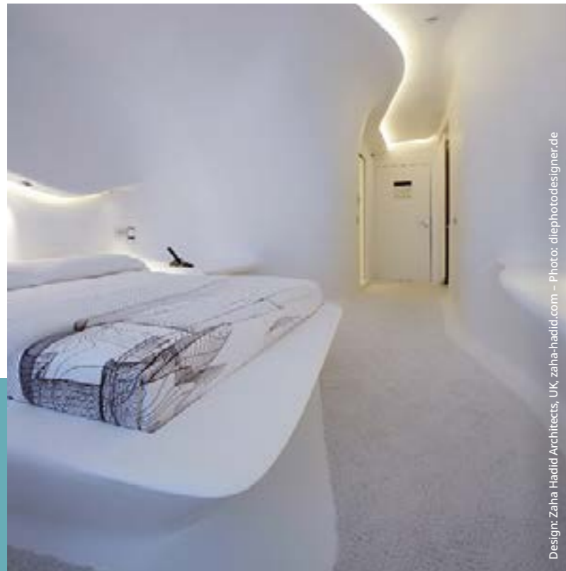
Design: Zaha Hadid Architects, UK, zaha-hadid.com