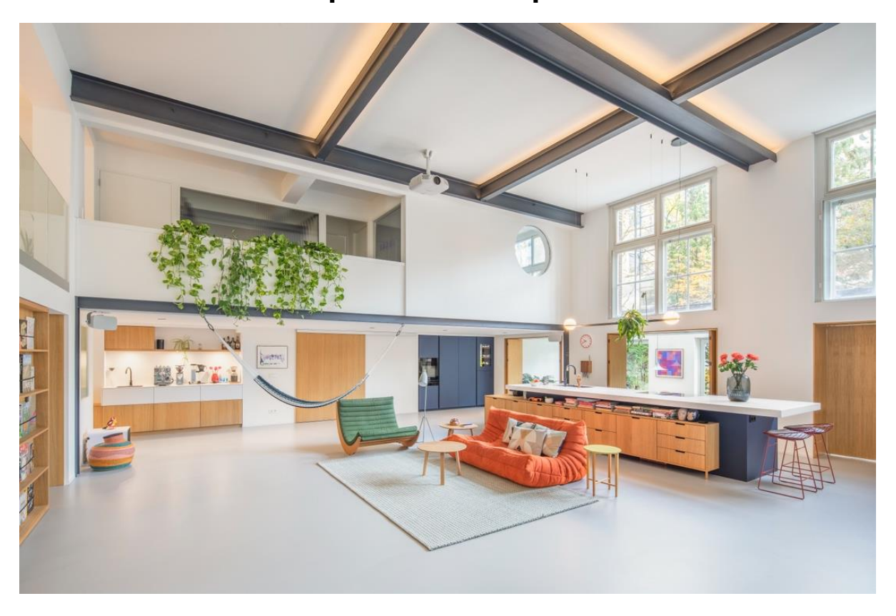
HIMACS, the solid surface material, in the iconic shade of Alpine White, was chosen for the surface of the kitchen island in this completely renovated former ballet school converted into a private home in Kerkstraat in the heart of Amsterdam's arts district.

Renowned architecture firm, Standard Studio, along with Brandsing Meubelmakers, a company specialising in furniture and renovation, was commissioned to carry out the complete transformation of a highly unusual space: a former ballet school located in the urban area of Kerkstraat in Amsterdam. This residential project represented a professional challenge due to the authentic characteristics of the original space , coupled with the owners' desire to build a homely, comfortable and warm house.