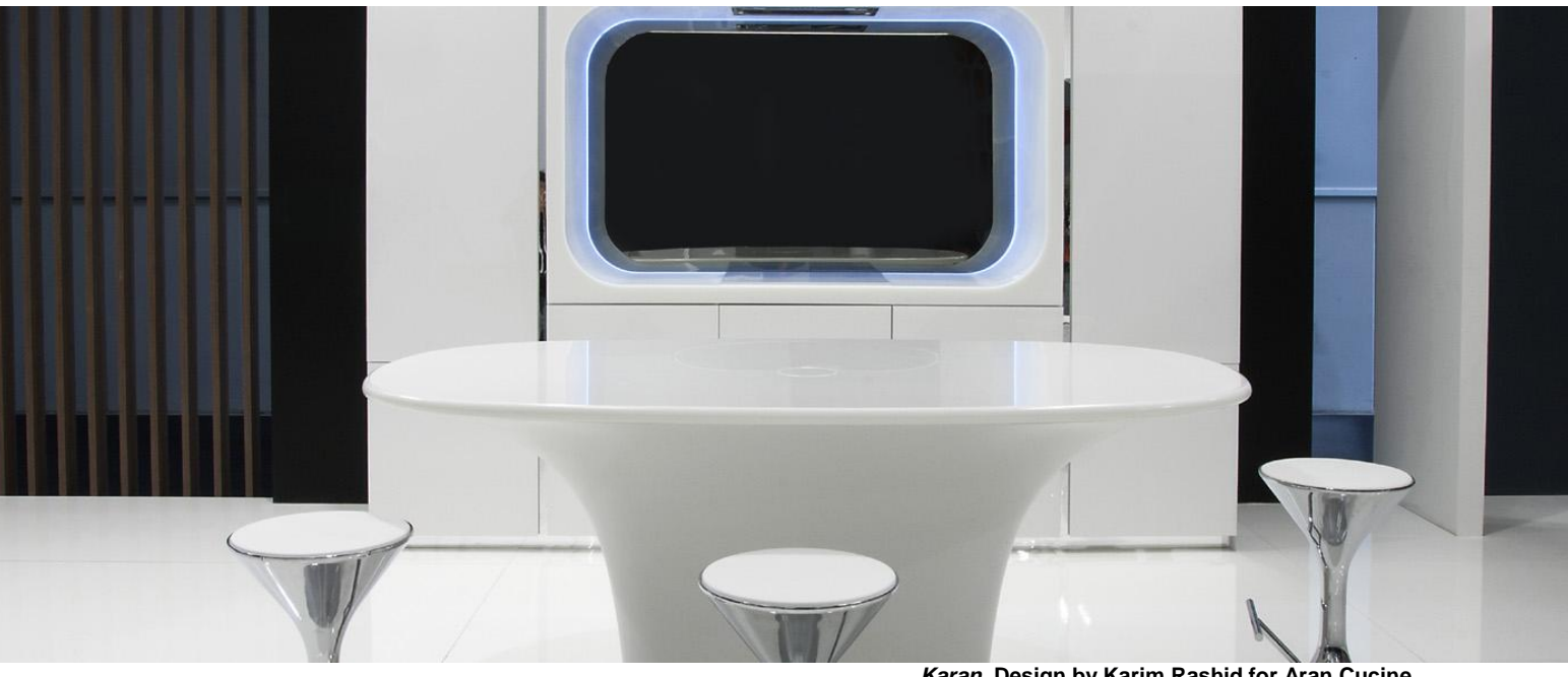
Karan, Design by Karim Rashid for Aran Cucine

The merger of Karim Rashid's futuristic vision with the extraordinary properties of HI-MACS<sup>®</sup>, the latest-generation acrylic stone, has given rise to Kook and Karan, two kitchens manufactured by Aran Cucine, remarkable for their ultimate originality.