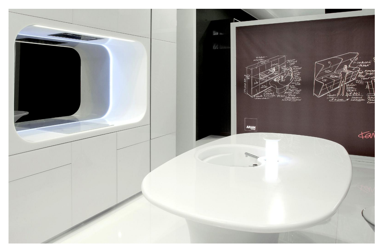
Karan, Design by Karim Rashid for Aran Cucine

The concept of Karan on the other hand, is based on an island, with a tapered silhouette, which encourages conviviality. When not in use, the mixer tap and LED light withdraw into the worktop. The simple addition of a multi-purpose chopping board which fits over the sink creates a handy dining area.