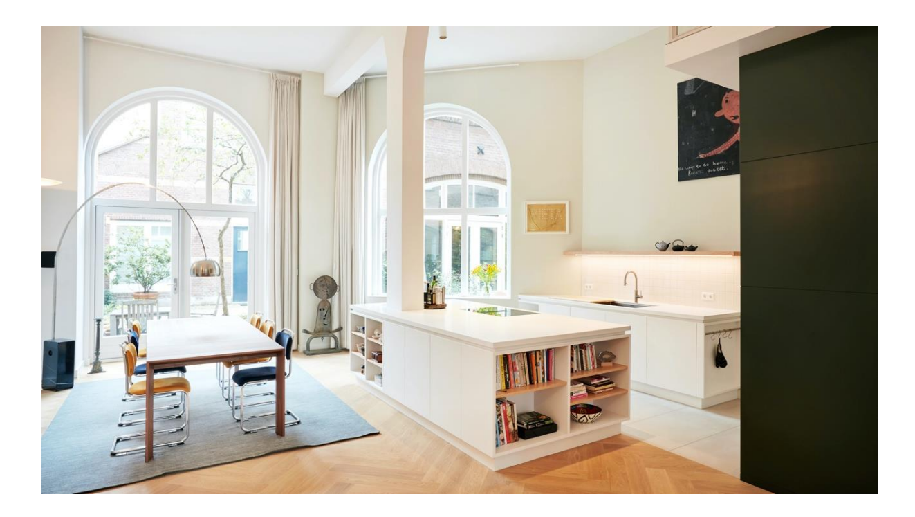
Jordaan Loft: HIMACS featured in a fabulous, bright loft

In keeping with a classic, industrial style, the iconic Alpine White shade of HIMACS endows this home's large kitchen island with a luminous prominence. Also used in the bathroom, LX Hausys' solid surface material played an important role in the complete remodel of this loft in the Jordaan district of Amsterdam.