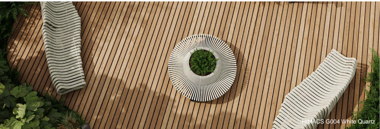
HIMACS G004 White Quartz

HIMACS Media contact for Europe: Mariana Fredes – Ph. +41 (0) 79 693 46 99 – mfredes@lxhausys.com High resolution images available: https://www.lxhausys.com/eu-en/case-studies