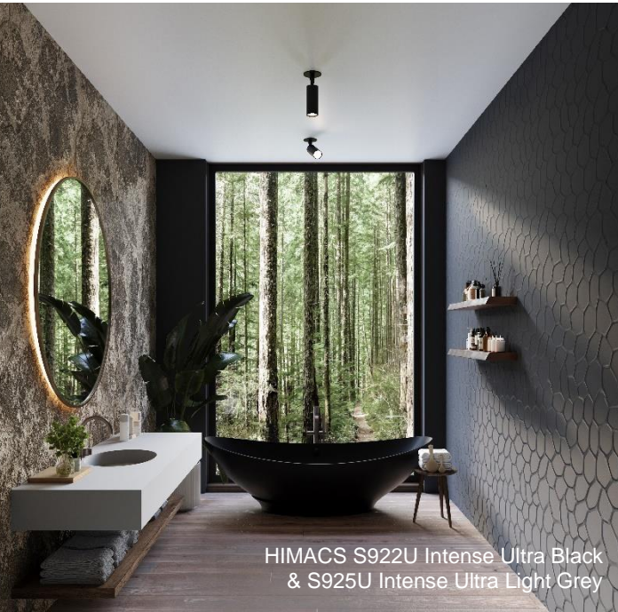
HIMACS S922U Intense Ultra Black & S925U Intense Ultra Light Grey