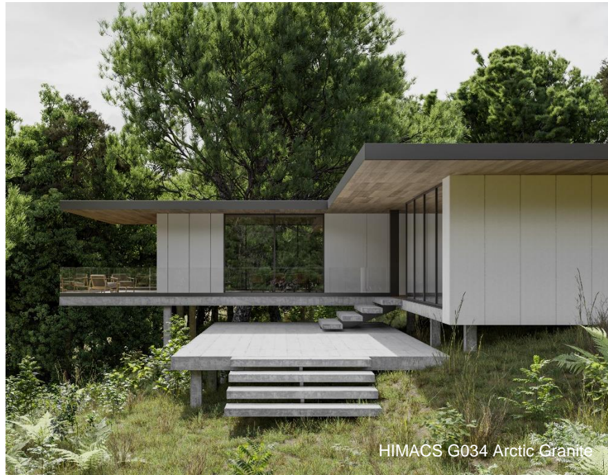
HIMACS G034 Arctic Granite