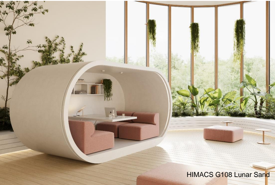
HIMACS G108 Lunar Sand