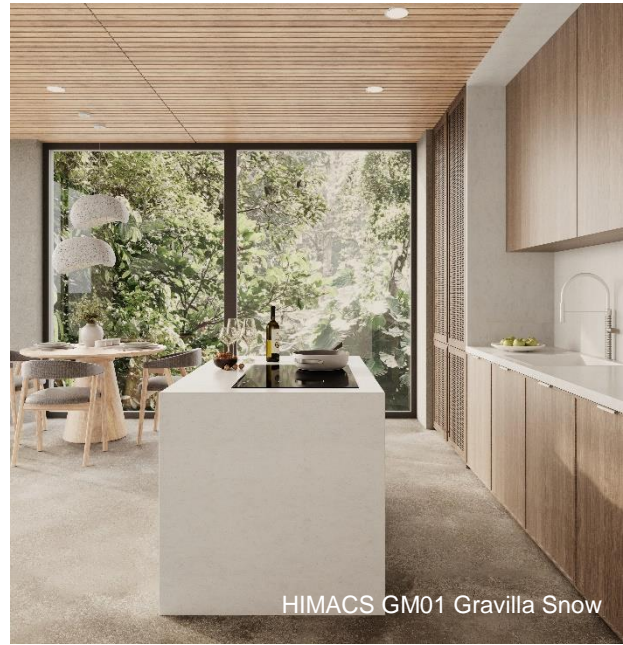
HIMACS GM01 Gravilla Snow