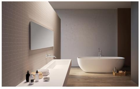
HI-MACS Structura® in a number of applications